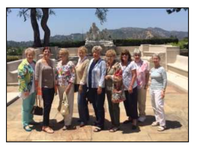
Quest at Forest Lawn

RSVP by August 2 to Carol Hoke at cawalrus@gmail.com or 714-891-8307 Dana Point Harbor was built in 1971. The harbor is located at the base of 200 foot cliffs. We will follow the trail at the base of the cliffs to the hidden sea cave and explore the tide pools on the way back. Perhaps we will see sea urchins, anemones, starfish and hermit crabs. We may be walking on small rocks along the way. Be sure to wear appropriate shoes. This hike is subject to change depending upon the tide. Lunch to follow.