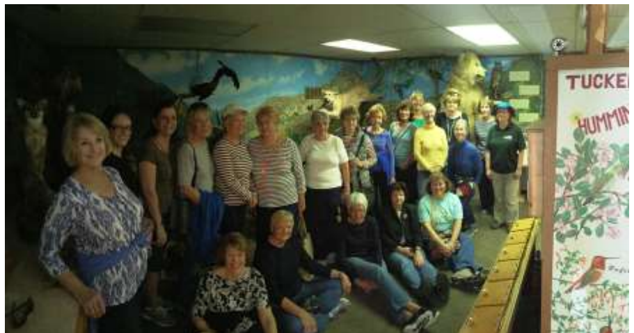
Quest tour of Tucker Wildlife Refuge, February

The Orange County Rescue Mission is known as the Village of Hope. It is a 2 year program to house, feed, clothe, and prepare adults to become self-sufficient through personal and professional development. They have facilities for one hundred ninety-two people who are single or married, and children are included. The services that are provided are spiritual, personal development, case management, counseling, parenting skills, child enrichment, medical and dental services. They work with the people so that they become employed and are self-sufficient at the end of the program. Village of Hope is staffed by volunteers. Their Mission is to minister the love of Jesus Christ to the Least, the Last, and the Lost of our community. It is a beautiful, uplifting campus and a fantastic organization.