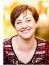
Abbi Waxman The Garden of Small Beginnings

Silent Auction Opportunity Drawing Book Sales and Signing Entertainment