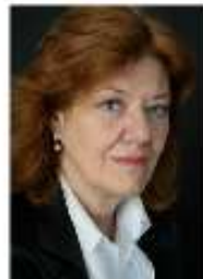
Anne Perry International Author of More Than 50 Novels