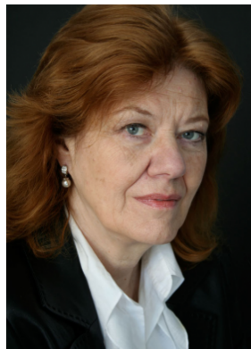
Anne Perry International Author of More Than 50 Novels