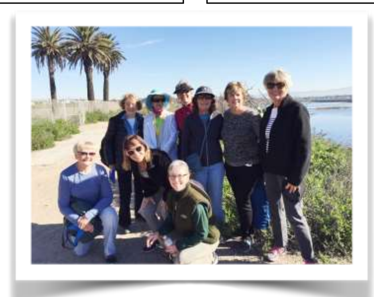
Happy Hikers toured Bolsa Chica Wetlands and visually feasted on the beautiful migrating birds.