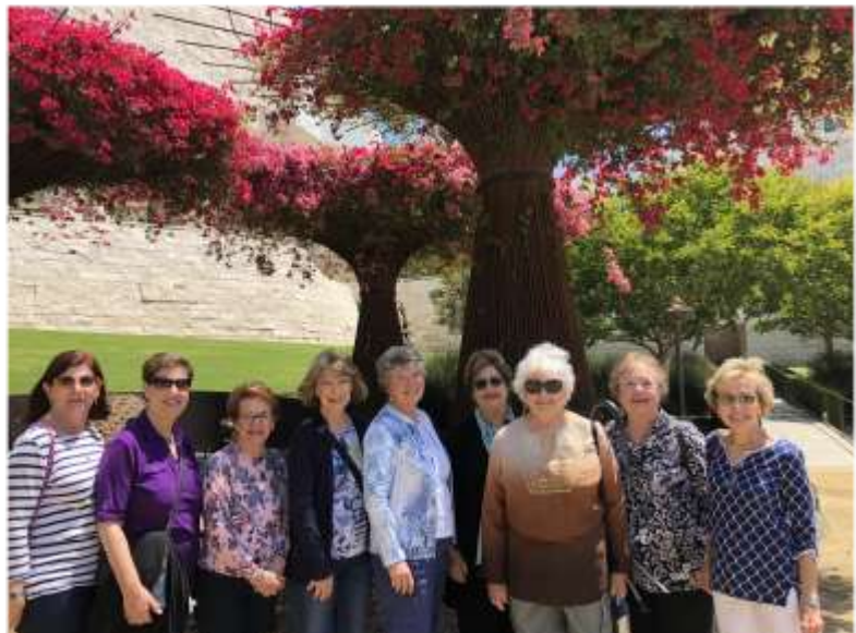
May Quest to the Getty Museum