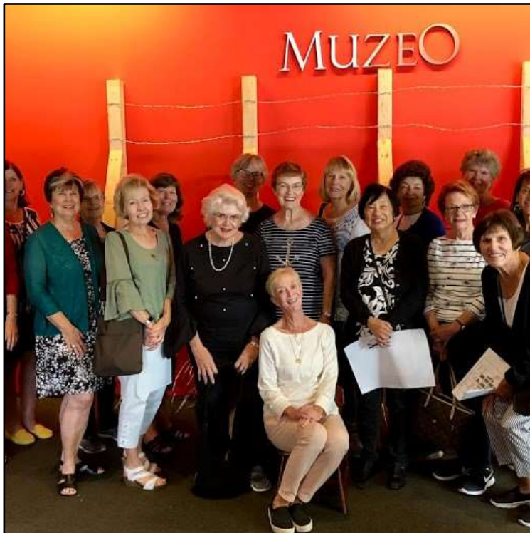
Quest for October, Muzeo, Anaheim