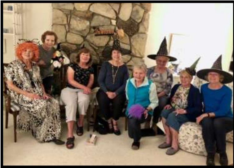
October Book Club Meeting