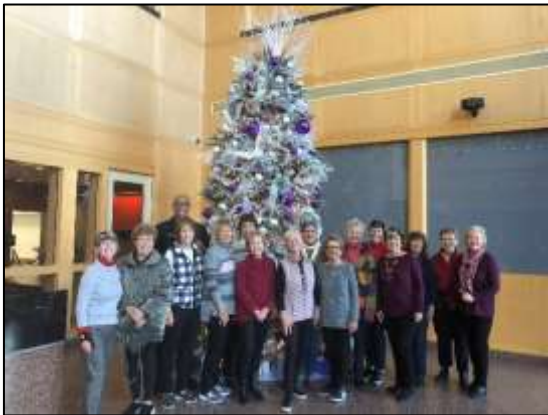
Quest to Federal Reserve L.A.

June 11: Los Angeles Central Library: CONFIRMED! (Using the Metro A Line and/or carpools)