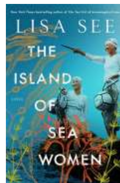
AAUW WM-FV-HB BRANCH

Authors Luncheon , March 21 was, unfortunately canceled.