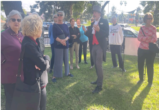
Quest Brembridge House Long Beech