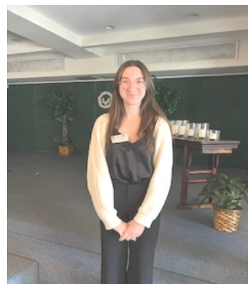
Golden West Scholarship Recipient